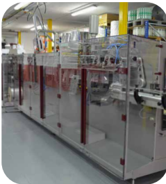
SANITARY DESIGN FRAME