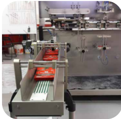
POUCH INFEED BELT

Compact, robust design, and inline operation, with easy access to all mechanisms, are highly appreciated in the food, chemical, pet food and beverages industries. Autoclave "retort" applications are also our expertise, by offering a reliable equipment that guarantees sealing integrity.